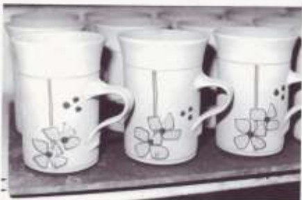
Below, Felicity decorating a planter with cobalt, iron and rutile pigments, and above completed ware ready for firing.