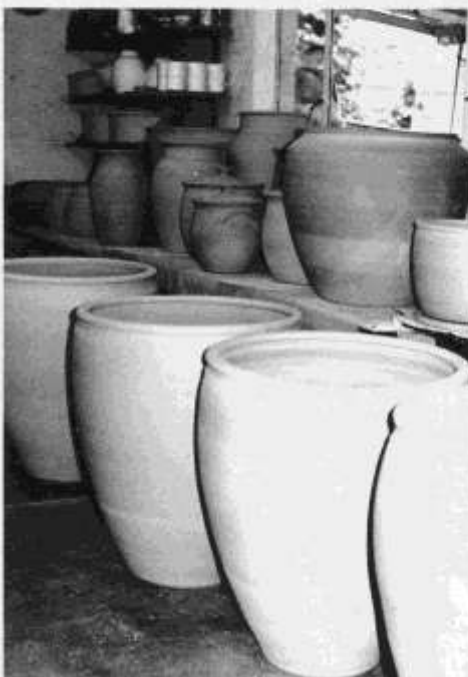
Top, bisque ready to be glazed and below, David packing their 90 cu. ft gas kiln for a glost firing.

Being on the Studio Route their studio is open to the public on the last Sunday of each month between 10h00 and 17h00. Should you be visiting Johannesburg at any other time call them on (011) 646-1170 for an appointment to view their superb work.