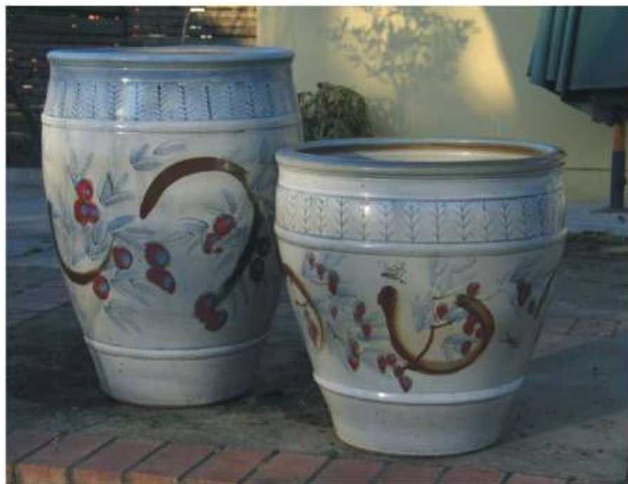
Giant planters, tallest 800mm, reduction-fired stoneware.