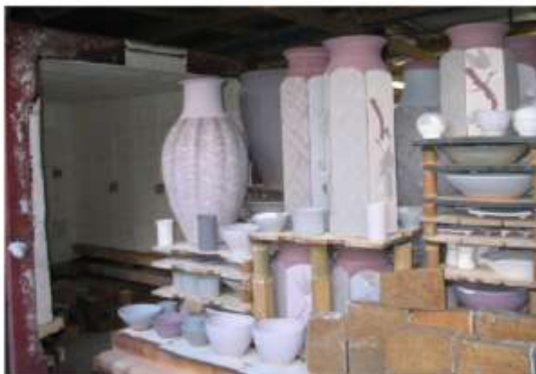
Big kiln ready for glaze firing.