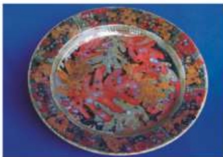
Platter, 580mm, reduction-fired stoneware.