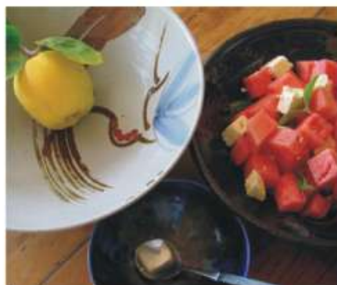
Salad – watermelon, feta & mint, quince in bowl.