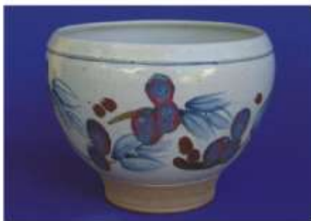
Bowl, 250mm diam, reduction-fired stoneware.