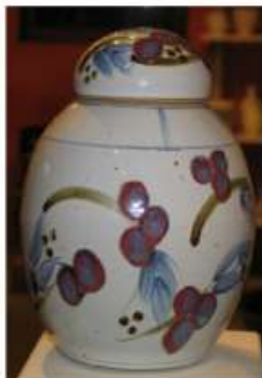
Ginger jar, 380mm, reduction-fired stoneware.