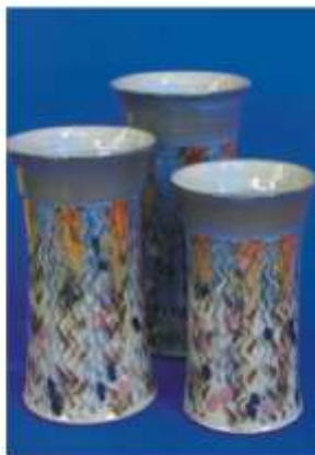
Cylinder vases, tallest – 340mm, reduction-fired porcelain.