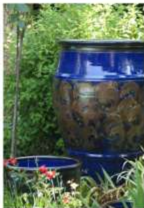
Giant planter, 800mm, reduction-fired stoneware.