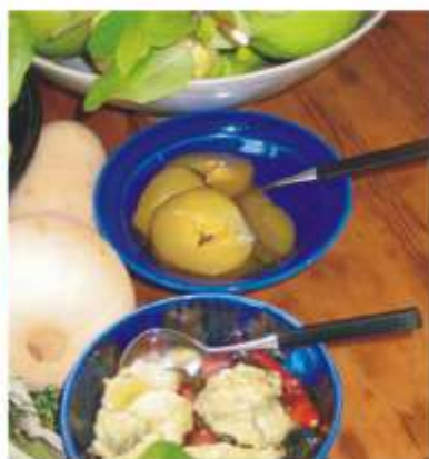
Porcelain bowls, 150 & 180mm.